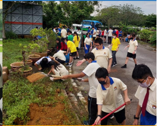
LEARNING BY DOING