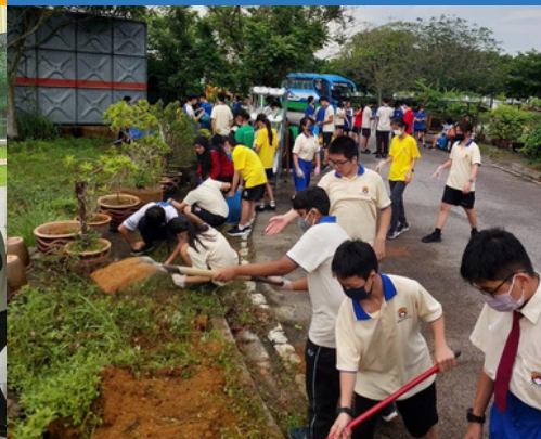
LEARNING BY DOING