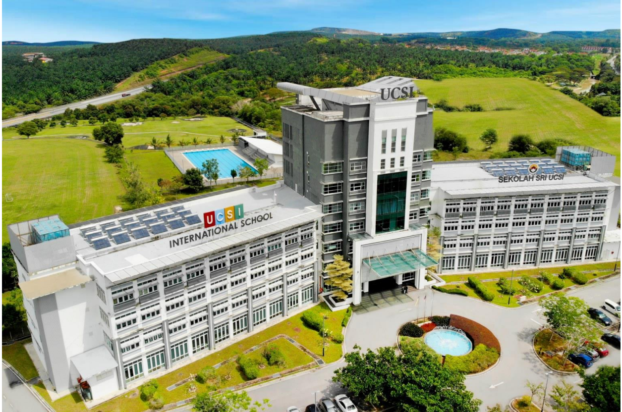
The Eagles: Issue 88