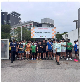
Students getting ready to run