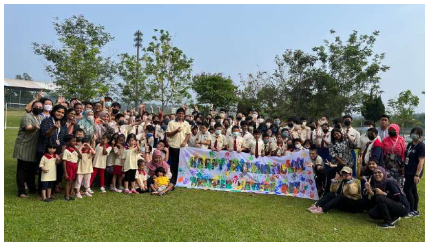
International Mother Earth Celebration - Towards Love and Care for the Earth