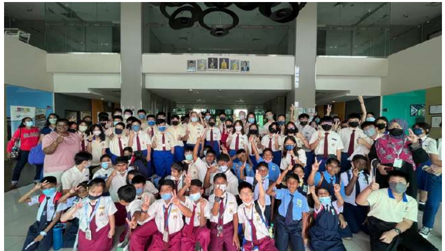
HIPPO Olympiad 2023 - Rising to Challenges!