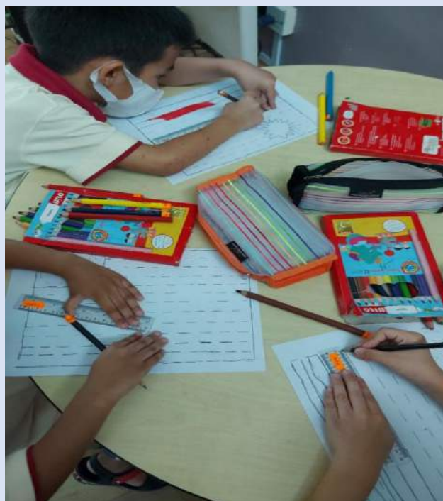
The students are drawing the national flag with teacher's guidance after watching the tutorial.