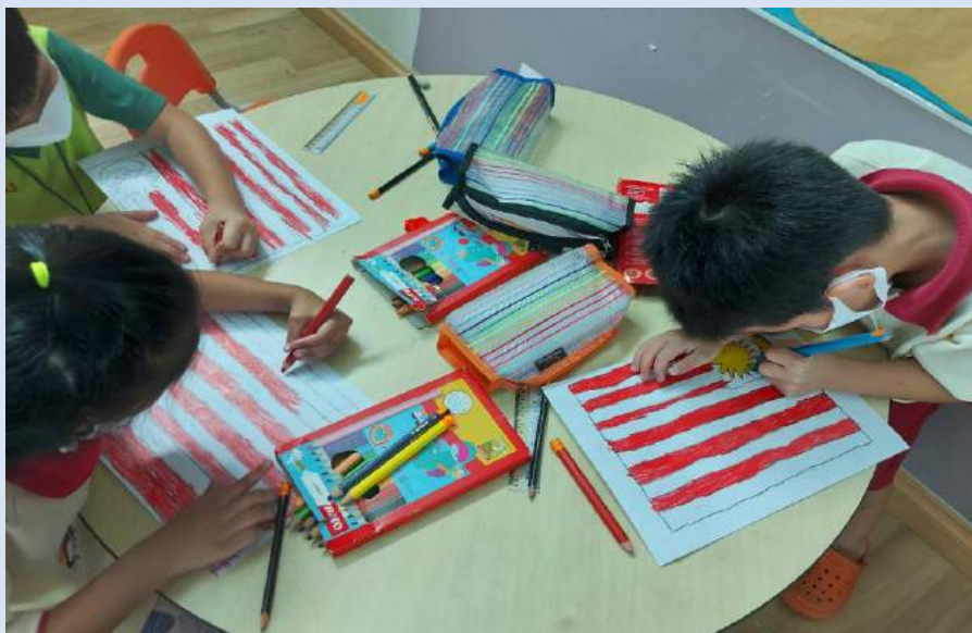
The students are colouring the drawing of the flag with the correct colour.