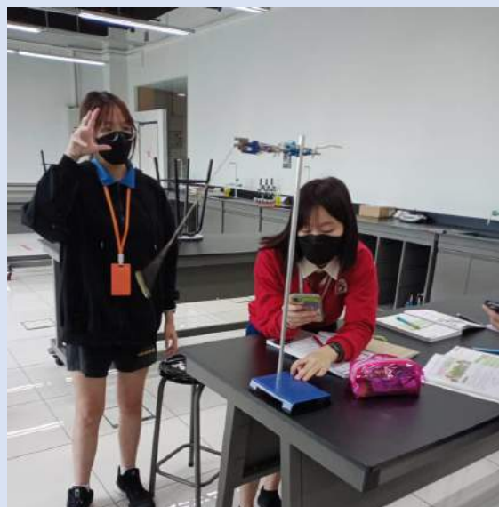
Students executed the experiment and recorded the time taken for 10 oscillations.