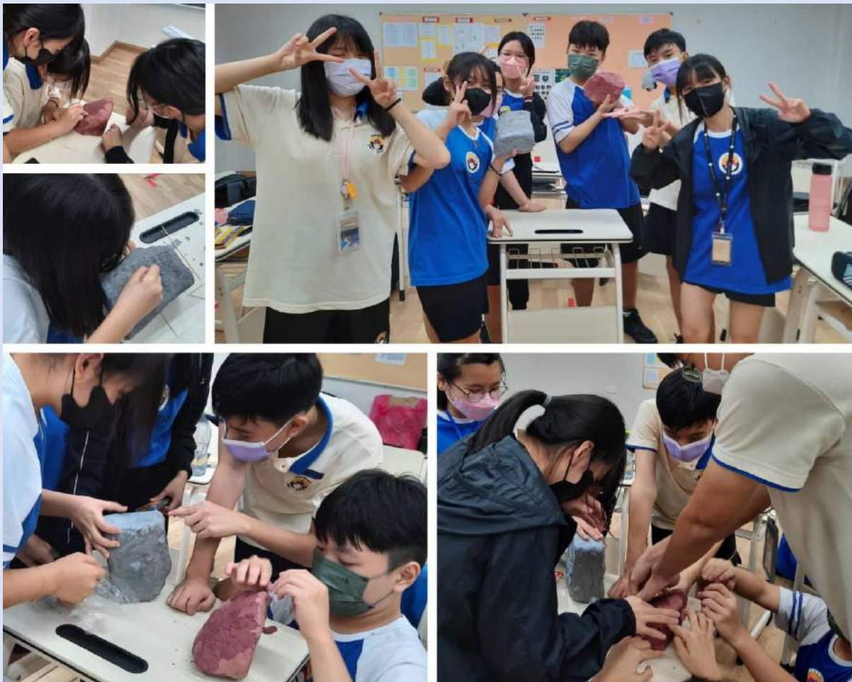
Pelajar bekerjasama menghasilkan replika batu bersurat.

Mereka menggunakan seketul batu yang mempunyai permukaan rata dan membalut seluruh permukaannya dengan plastisin. Kemudian mereka menulis perkataan di atas permukaan plastisin tersebut menggunakan lidi yang tajam. Kesemua pelajar bekerjasama antara satu sama lain sepanjang melakukan aktiviti ini. Hasil replika batu bersurat yang mempunyai nama kerajaan Alam Melayu dan nama pelajar dipamerkan di dalam kelas. Aktiviti ini mendedahkan pelajar tentang medium komunikasi masyarakat suatu Ketika dahulu yang boleh menjadi sumber rujukan.