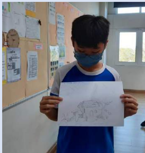
Salah seorang pelajar menunjukkan hasil lukisan seni binanya.