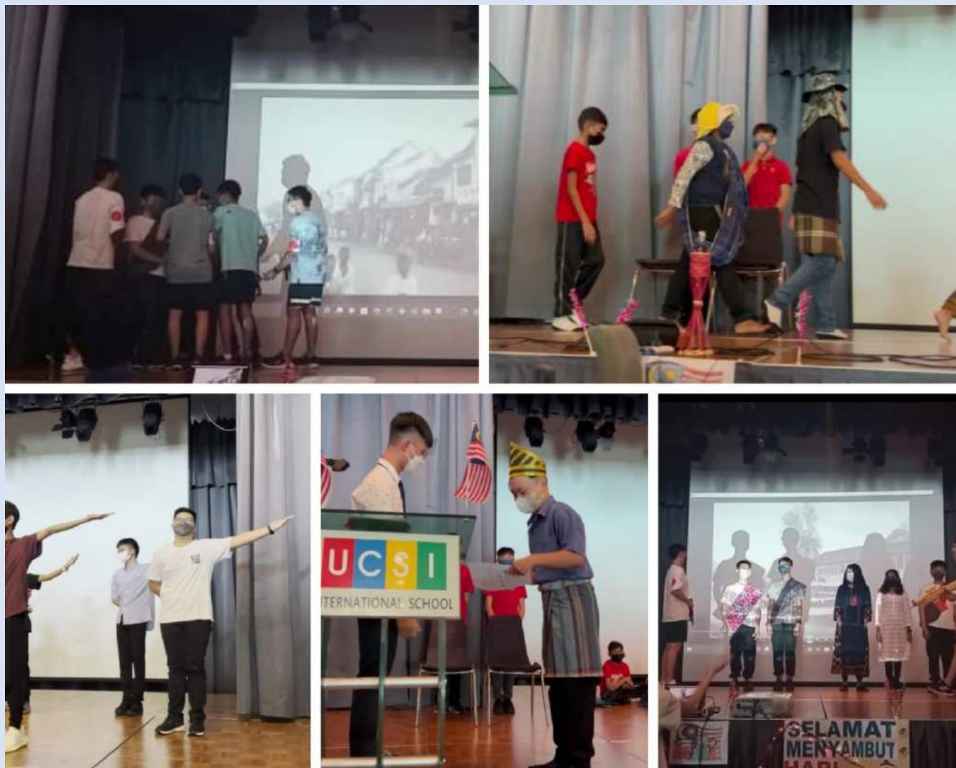
Secondary students showcased a sketch about the journey of Malaysia in gaining its independence.