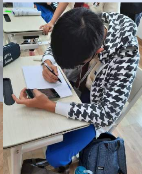
Pelajar melakar seni bina yang telah dibincangkan itu.