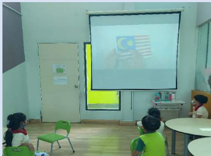
The students are watching the tutorial on how to make a national flag.