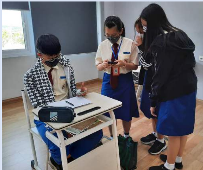
Perbincangan idea bersama ahli kumpulan.

Pembelajaran tentang seni bina mendedahkan pelajar tentang pelbagai bentuk seni bina yang wujud Ketika Kerajaan Alam Melayu. Daripada hasil pembelajaran, pelajar diminta menjana idea untuk menghasilkan lukaran seni bina berkonsepkan kelestarian alam sekitar. Pelajar membuat tugas ini secara berkumpulan di mana seorang daripadanya akan melukis seni bina yang telah dibincangkan. Setelah siap, hasil lukisan mereka dipamerkan di dalam kelas. Aktiviti ini memberikan kesedaran kepada pelajar tentang pentingnya pembangunan secara terancang.