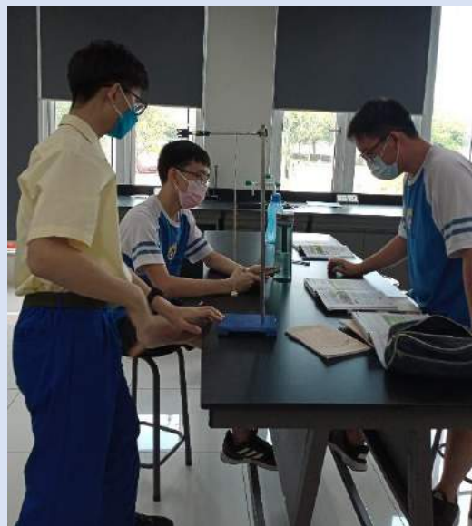
Students successfully setting up their pendulum and did a group discussion to investigate the factors affecting the time taken for 10 oscillations of pendulum.