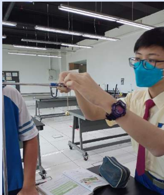
Students setting up their DIY pendulum with the materials provided by the teacher.