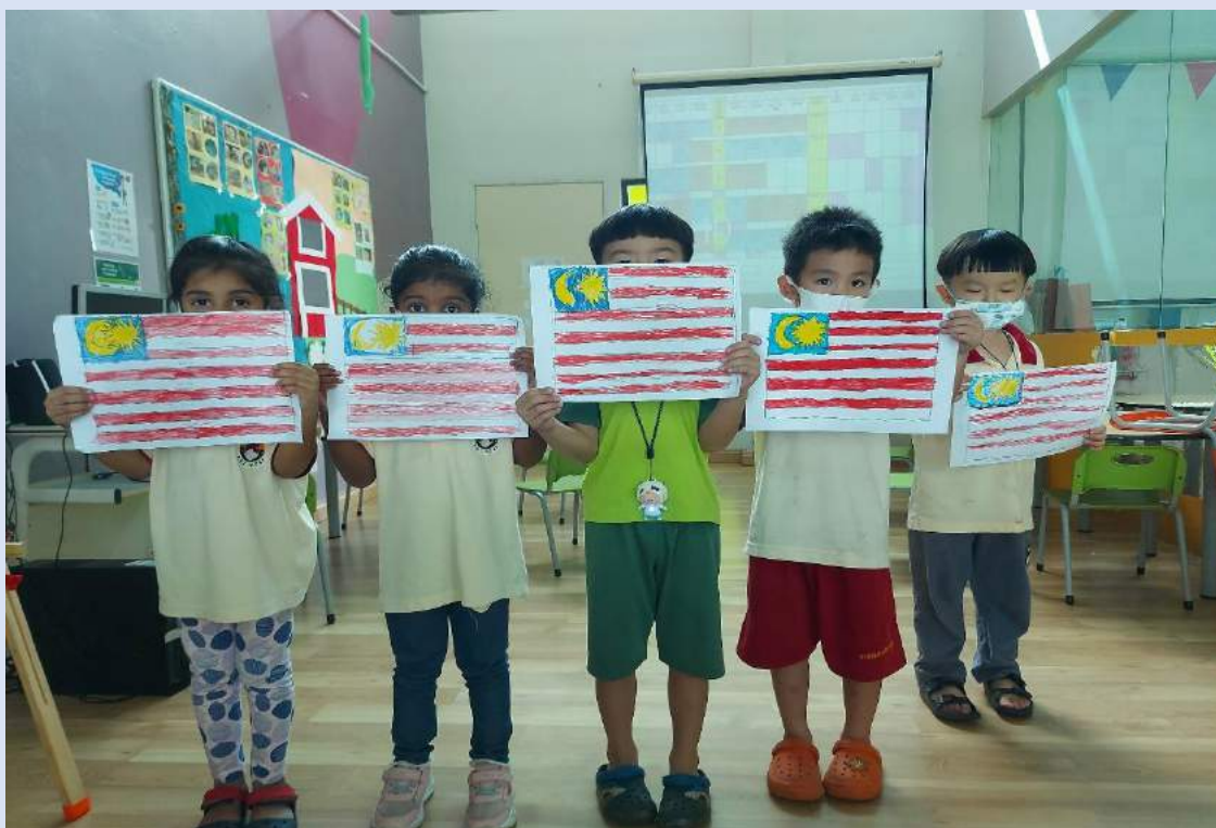
Students with the Malaysian Flag.