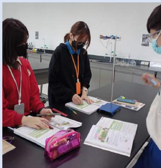
Students exploring other factors which can affect the time taken for 10 oscillations of pendulum.