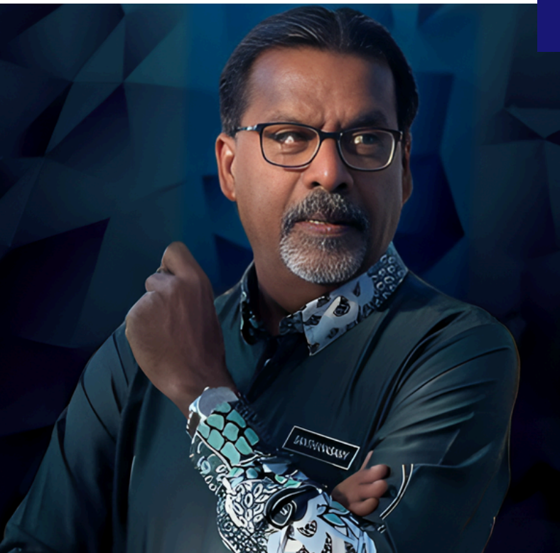
HEAD OF UCSI SPRINGHILL CAMPUS & PRINCIPAL